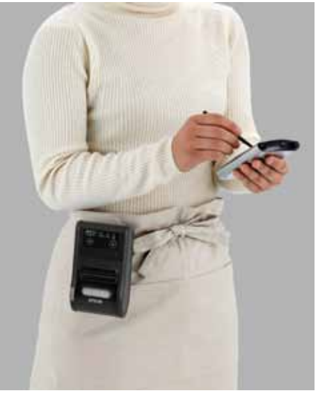
Easy and comfortable to carry with integrated belt clip.