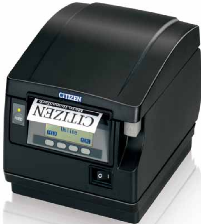
CT-S851 (available in black or white)