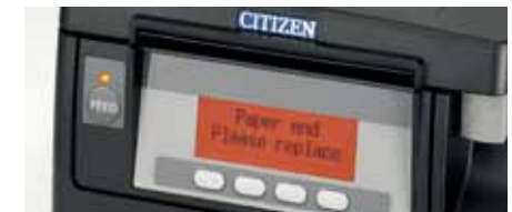
Error message with instruction