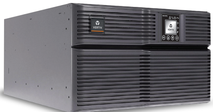
Liebert GXT4 5 - 10 kVA