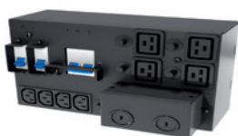
Front view Power Distribution (PD2-CE10HDWRMBS)