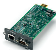
Vertiv IntelliSlot Communication Card