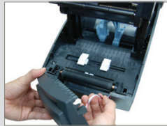
Auto-Cutter : Easy installation