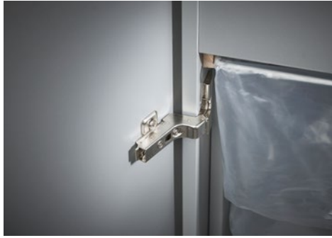
Dahle Waste 206 document shredder