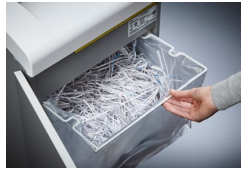
Dahle Waste 206 document shredder