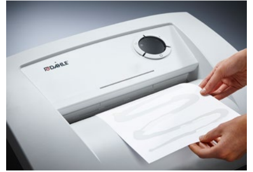
Dahle Waste 206 document shredder