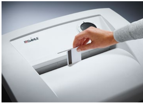
Dahle Waste 206 document shredder