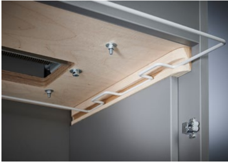
Dahle Waste 206 document shredder