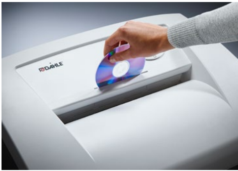
Dahle Waste 206 document shredder